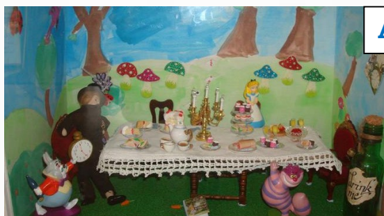
Alice in Wonderland

We hope that all of these reading activities will encourage the children to continue to develop a love for reading.