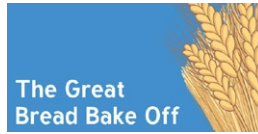
The Great Bread Bake Off