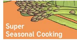
Super Seasonal Cooking