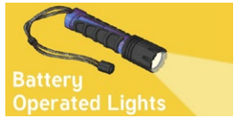
Battery Operated Lights