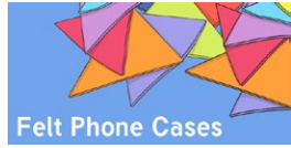
Felt Phone Cases